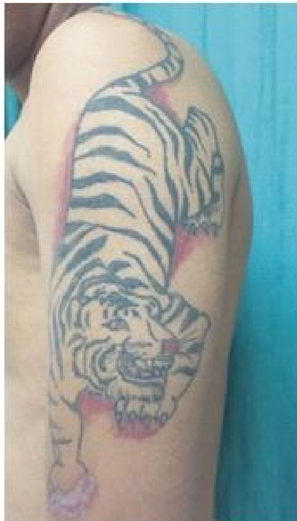
Fig. 1: Tattoo over left arm