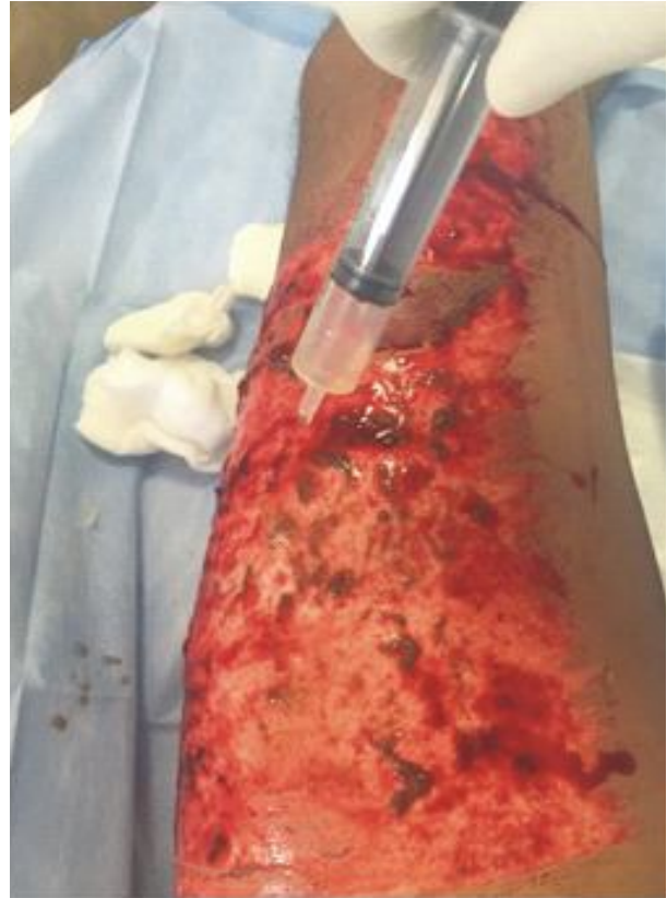
Fig. 5: Healed donor site in 7 days

Dermabrasion is a simple, cost-effective means of skin resurfacing that can provide repeated and reliable results when used on the face or many other areas of the body. Numerous studies have demonstrated that dermabrasion is a reliable and effective method for skin resurfacing and should be a part of a plastic and dermatologic surgeon's repertoire in resurfacing damaged skin and the aging and damaged face.